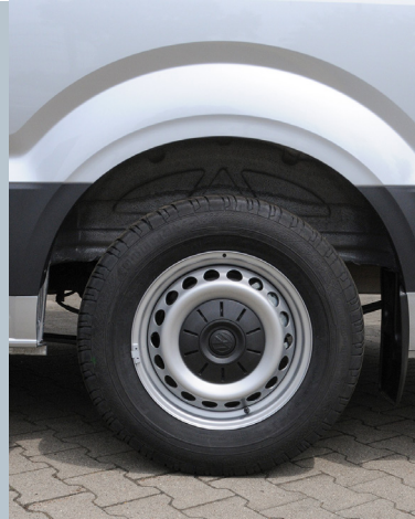
Vehicle ready for departure (standard height).