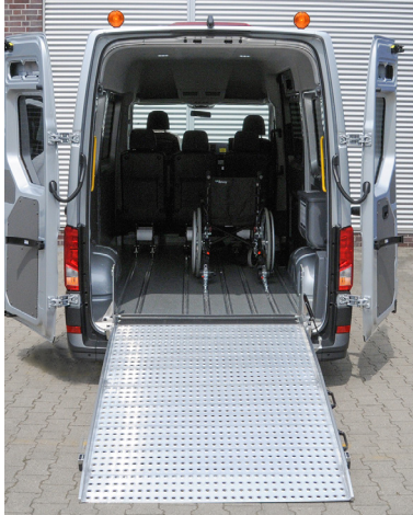
The lowered vehicle can be accessed by the wheelchair.