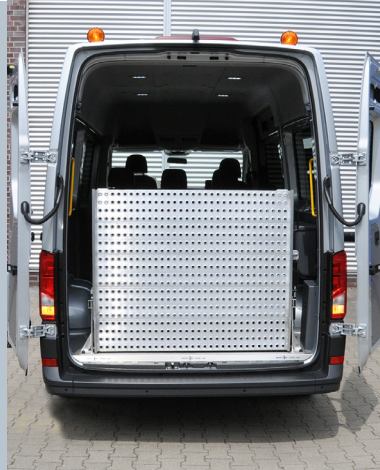
Vehicle with folded ramp. Rear view is maintained.