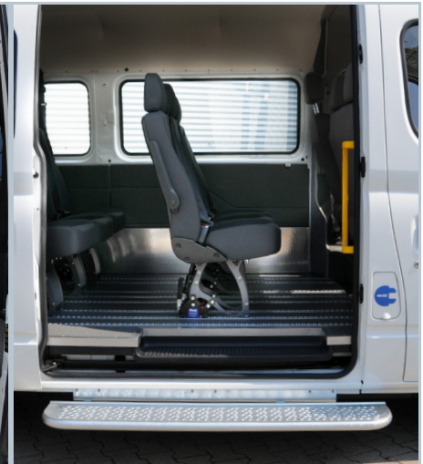
Step and grab handle at the side entry allow easy access to the passenger cabin.