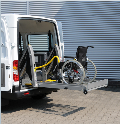
Wheelchair safely enters the vehicle via the lift.