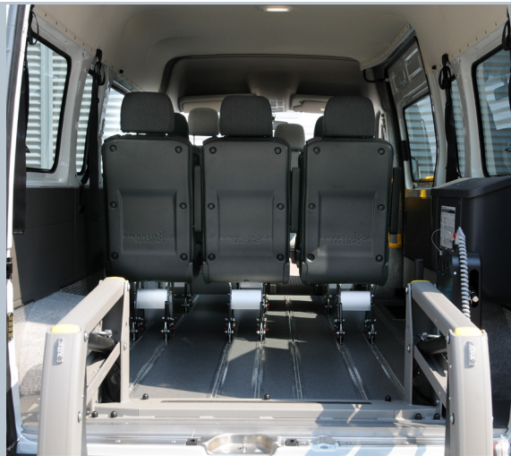
Smartfloor provides flexibility inside your vehicle.