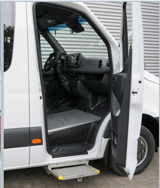
Fully automatic AMF-Bruns electric step at side or front entrance