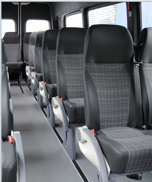
Comfortable and ergonomically formed M2 seats

Mercedes-Benz Sprinter - M2 minibus (13 - 19 seater)