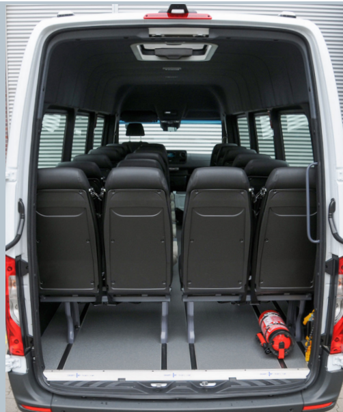
The AMF-Bruns Smartliner offers a spacious passenger compartment