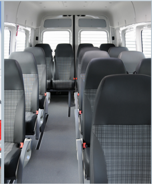
Smartliner meets all regulations for M2 minibusses