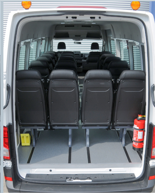
The AMF-Bruns Smartliner offers a spacious passenger compartment