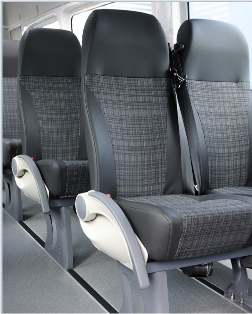
Comfortable and ergonomically formed M2 seats

Volkswagen Crafter - M2 minibus (13 - 16 seater)