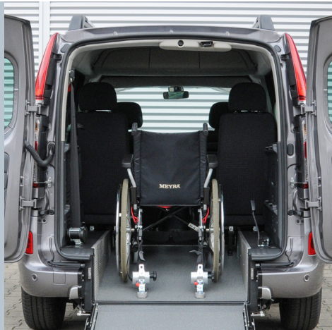
The PROTEKTOR restraint system secures wheelchair and person while driving.