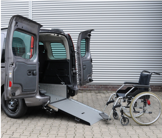
With the unfolded ramp the vehicle can be accessed with a wheelchair.

Mercedes-Benz Citan long / Citan extra-long