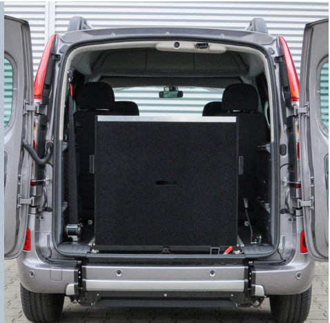
Vehicle ready for departure with ramp folded up.