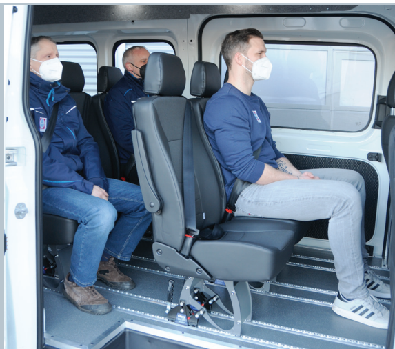
Smartseats can be flexibly arranged in the passenger cabin as needed.