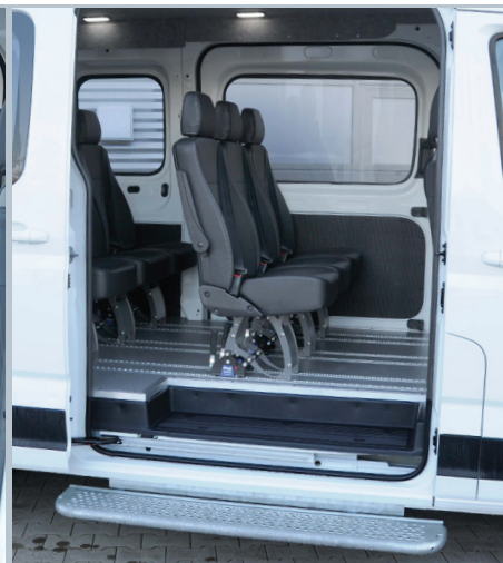
Step at the side entry allow easy access to the passenger cabin.