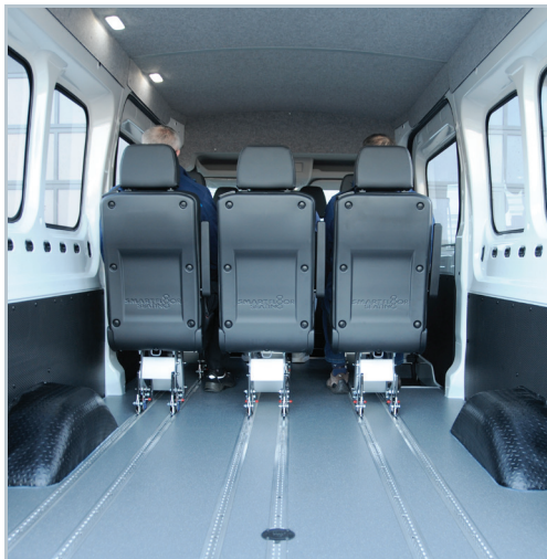
Smartfloor provides flexibility inside your vehicle.

SAIC Maxus eDeliver 9 9-seater (72 kWh battery)