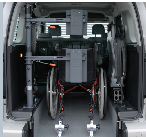
The head & backrest FUTURESAFE (optional) provides additional safety.