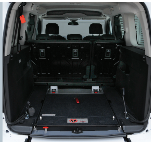
Optional EASYFLEX ramp folded flat allows full use of the luggage area.