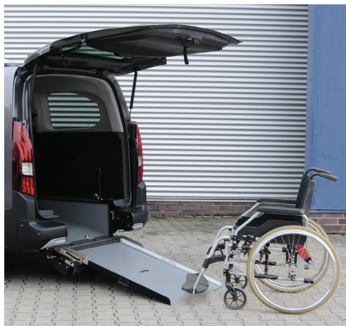
With the unfolded ramp the vehicle can be accessed comfortably with a wheelchair.