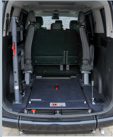
The EASYFLEX ramp folded flat allows full use of the luggage area (optional).