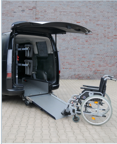
With the unfolded ramp the vehicle can be accessed comfortably with a wheelchair.