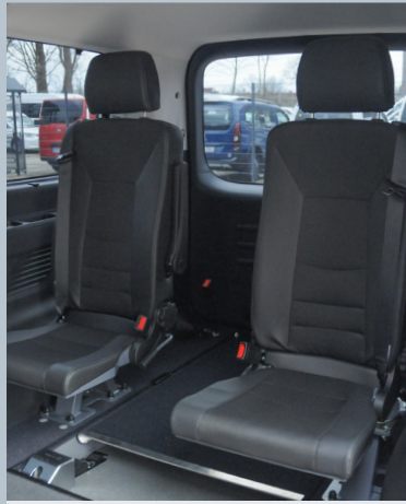
Optional tip & fold seats in third row allow flexible use of the vehicle.