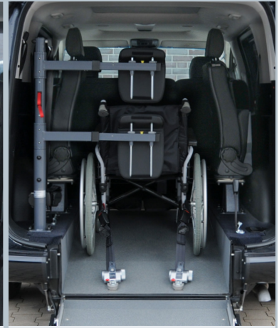
The vehicle can be equipped with the head & backrest FUTURESAFE (optional).