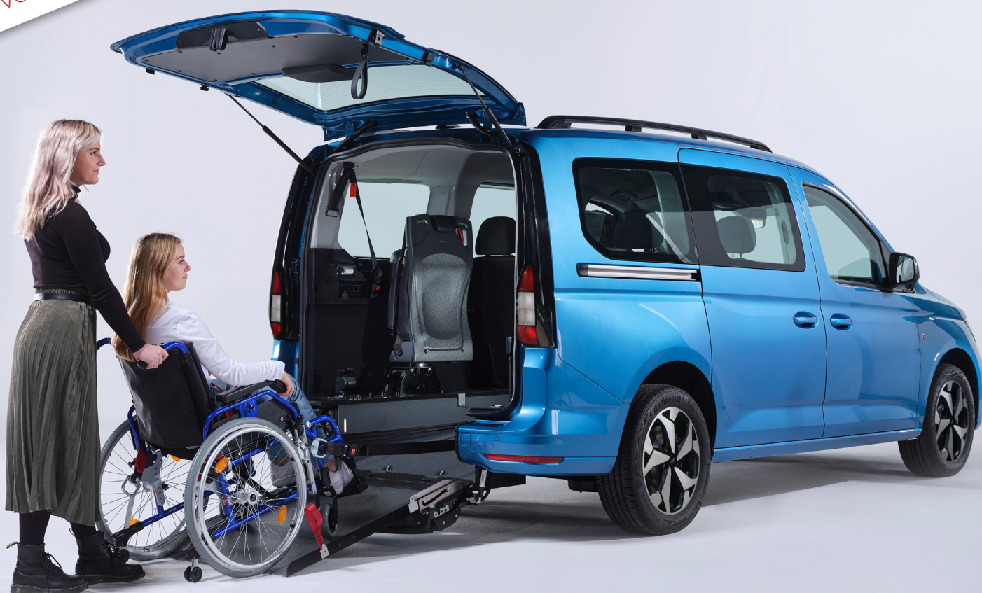
Image shows Ford Grand Tourneo Connect