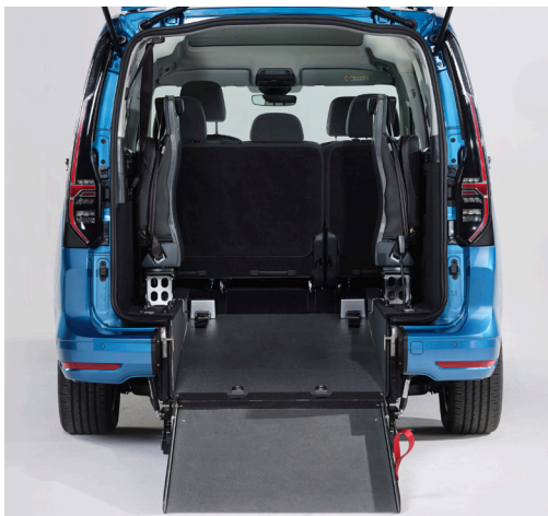
With the unfolded ramp the vehicle can be accessed comfortably with a wheelchair.

Ford Tourneo Connect / Ford Grand Tourneo Connect