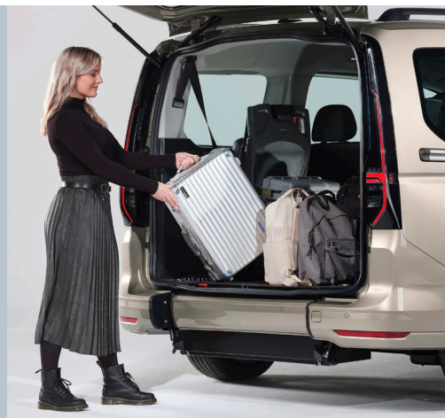
With the optional EASYFLEX ramp flat folded the luggage compartment is fully usable.