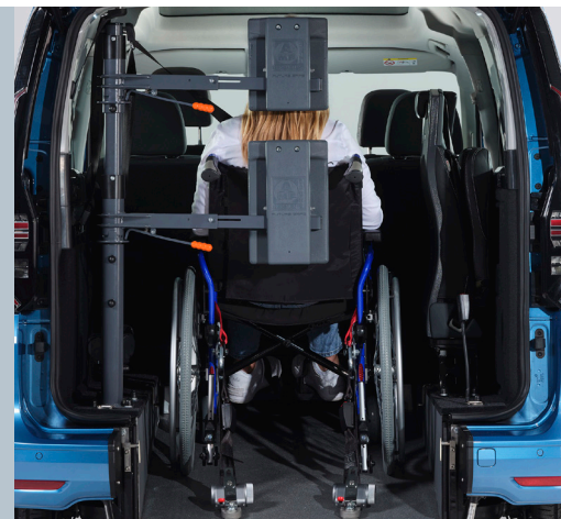
Optionally, the vehicle can be equipped with the head & backrest FUTURESAFE.