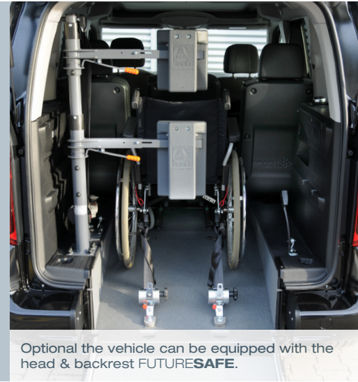
Optional the vehicle can be equipped with the head & backrest FUTURESAFE.