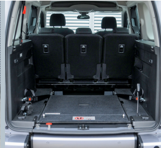
Optional EASYFLEX ramp folded flat allows full use of the luggage area.