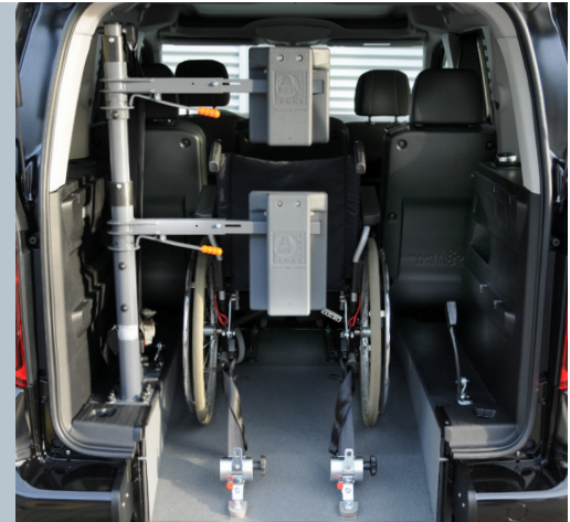
Optional the vehicle can be equipped with the head & backrest FUTURESAFE.