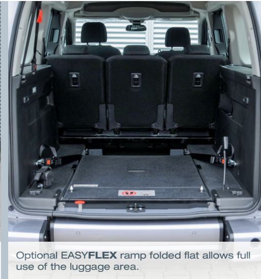
Optional EASYFLEX ramp folded flat allows full use of the luggage area.