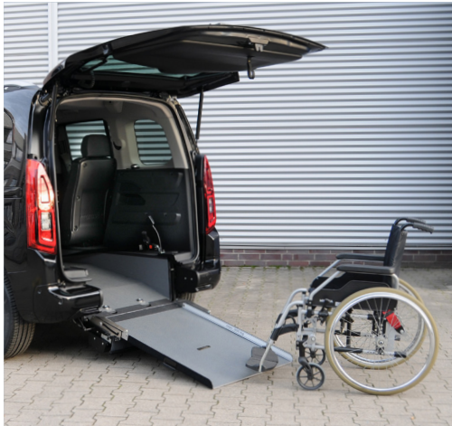
With the unfolded ramp the vehicle can be accessed comfortably with a wheelchair.