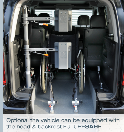
Optional the vehicle can be equipped with the head & backrest FUTURESAFE.