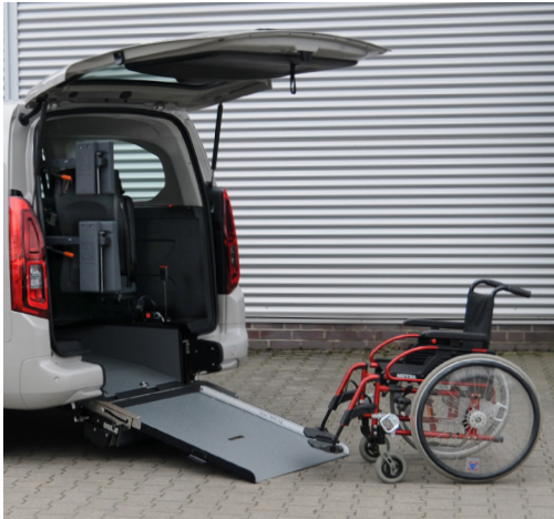
With the unfolded ramp the vehicle can be accessed comfortably with a wheelchair.