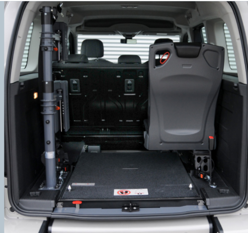
Optional EASYFLEX ramp folded flat allows full use of the luggage area.