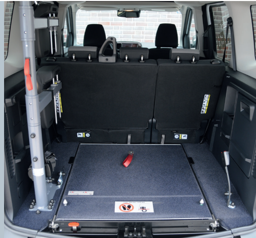
With the optional EASYFLEX ramp folded down the luggage compartment is fully usable.