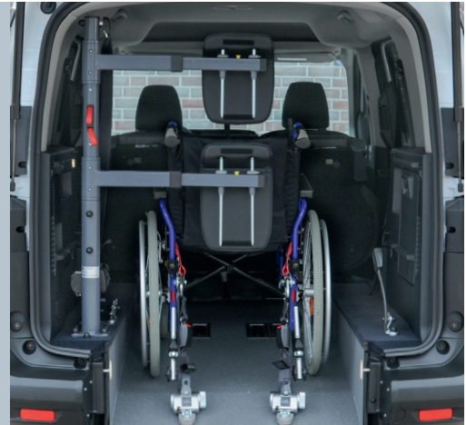
The optional head and backrest FUTURESAFE 2.0 provides extra safety.