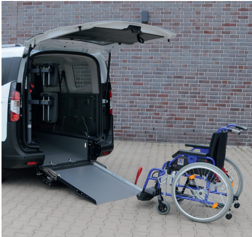
With the unfolded ramp the vehicle can be accessed comfortably with a wheelchair.